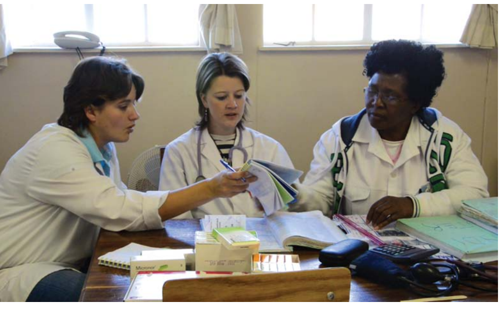
Photo: Courtesy of Trisha Pasricha, personal collection (from the documentary "A Doctor of My Own", directed by T. Pasricha)

The majority of program–related jobs were identified to be at the senior program management and direction level (58% (87/149) ( Figure 1 , plate D). Second most common were supportive program functions (28% 41/149) followed by other support activities (9% 13/149) and program financing (5% 8/149) ( Figure 1 , plate D). Salary information, which could provide a basis for assessing the strength of de-