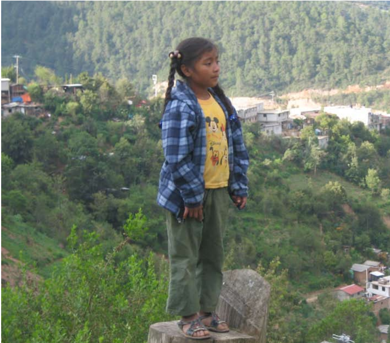
Gary's photograph captures a girl in contemplative mood, with Oaxaca in the background